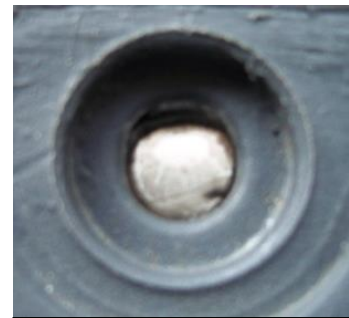
GRIP eliminates voids and blowouts